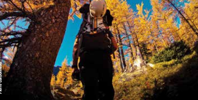
Banff National Park

Travel the entire length of the Valley of the Ten Peaks, wandering steadily into a high alpine environment to reach this spectacular pass on the Continental Divide.