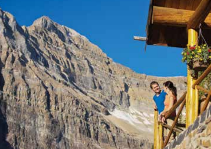
Banff National Park parks.canada.gc.ca