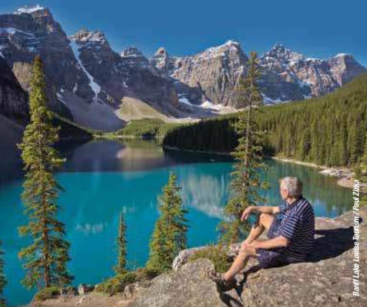
Banff National Park parks.canada.gc.ca

Green forested valleys provide a vital food source for grizzly bears and other species. This is the Lake Louise and Icefields area of Banff National Park, a landscape of wonder which has been dubbed the “hiking capital of Canada”. Use the trail descriptions to choose a hike suitable for everyone in your party.